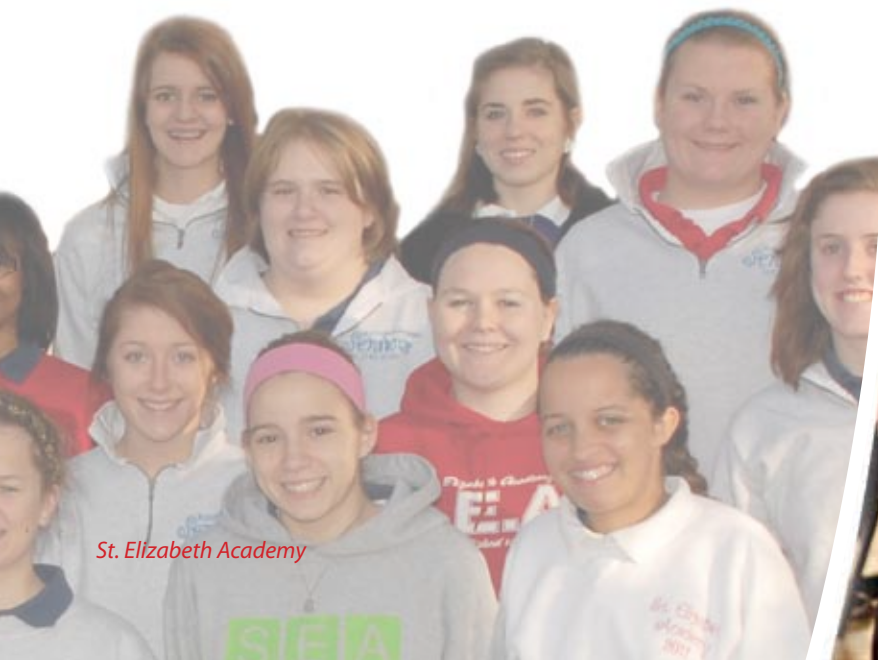
St. Elizabeth Academy